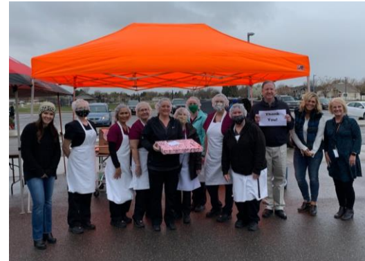
Weber School District