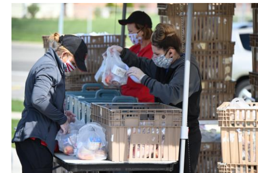
Salt Lake City School District