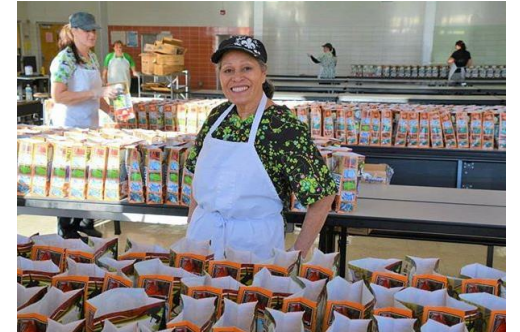
Tooele School District