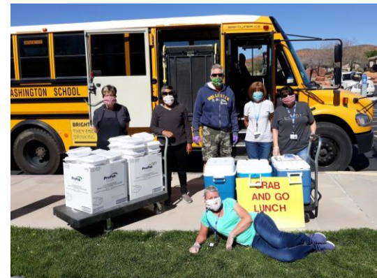
Washington School District