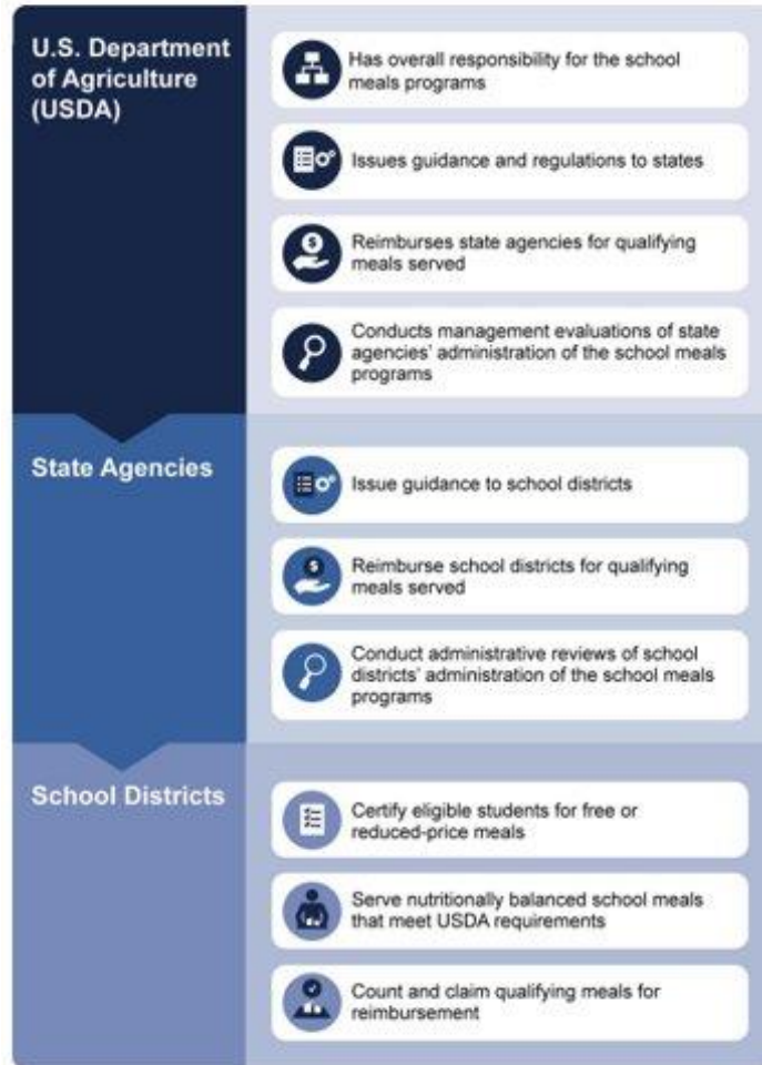
Figure 1: Summary of Responsibilities for Administering the School Meals Programs

Source: GAO summary of USDA information. | GAO-19-389