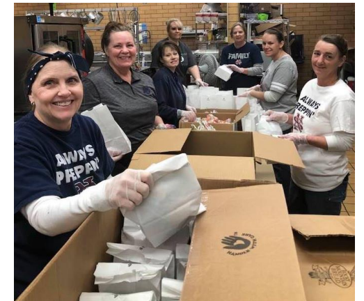
Sevier School District